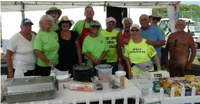
West Grove Food Court — CASH ONLY —