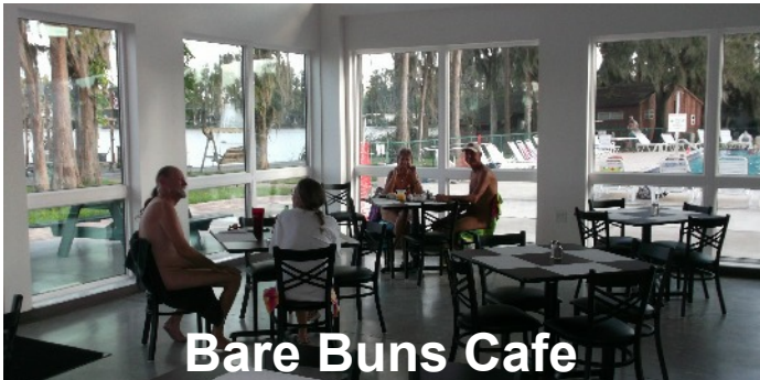
Bare Buns Cafe

Cash, credit card, or prepaid Como card — NO OPEN ACCOUNTS —