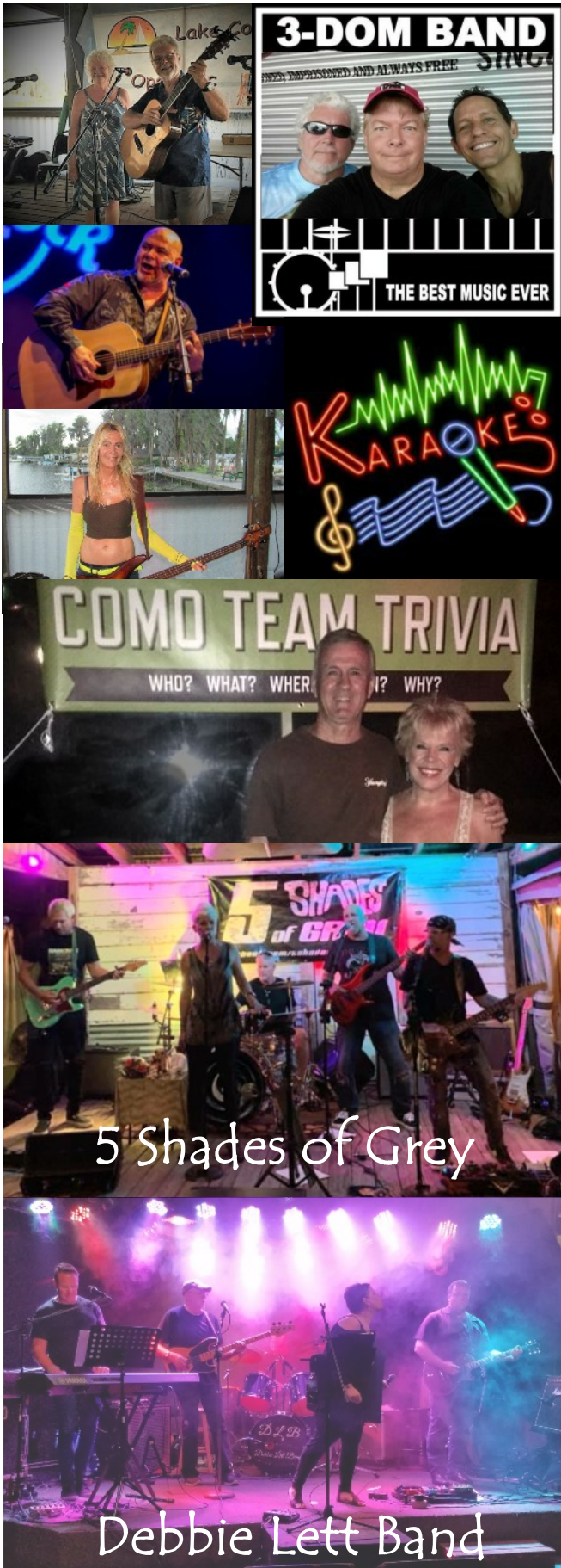
5 Shades of Grey