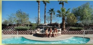
Mira Vista Nudist Resort, AZ