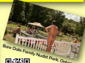
Bare Oaks Family Nudist Park, Ontario